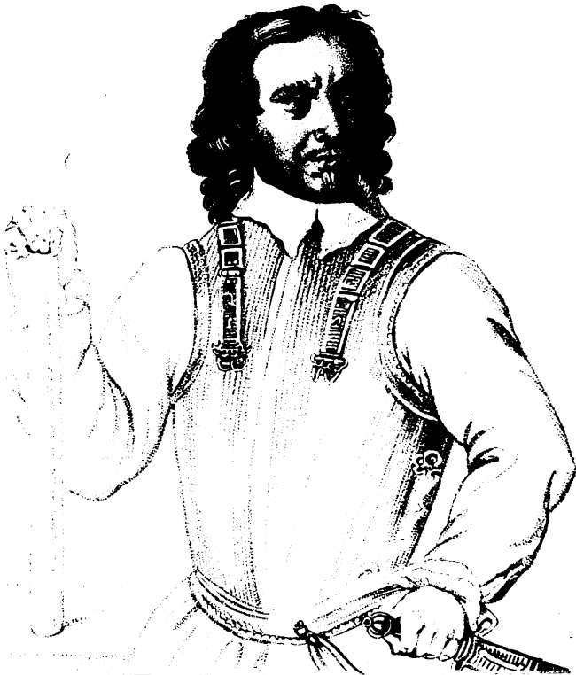
A Cooper sculpt'