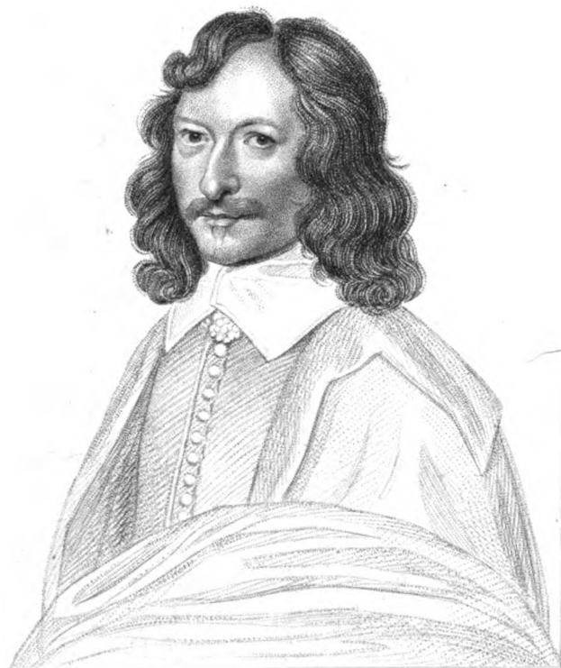
H Cooper sculp'