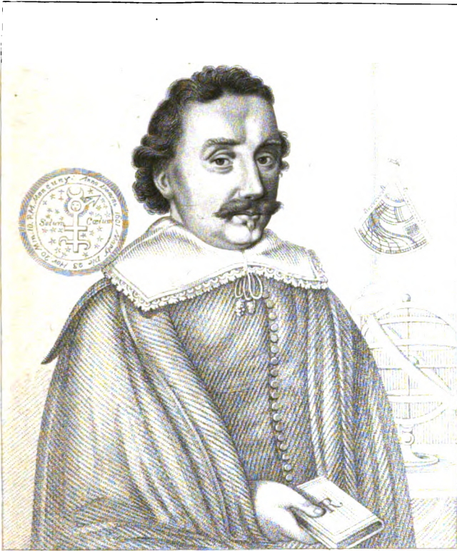
R Cooper sculp t