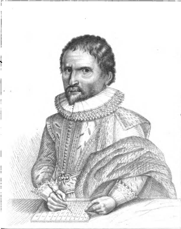
R Cooper sculp r